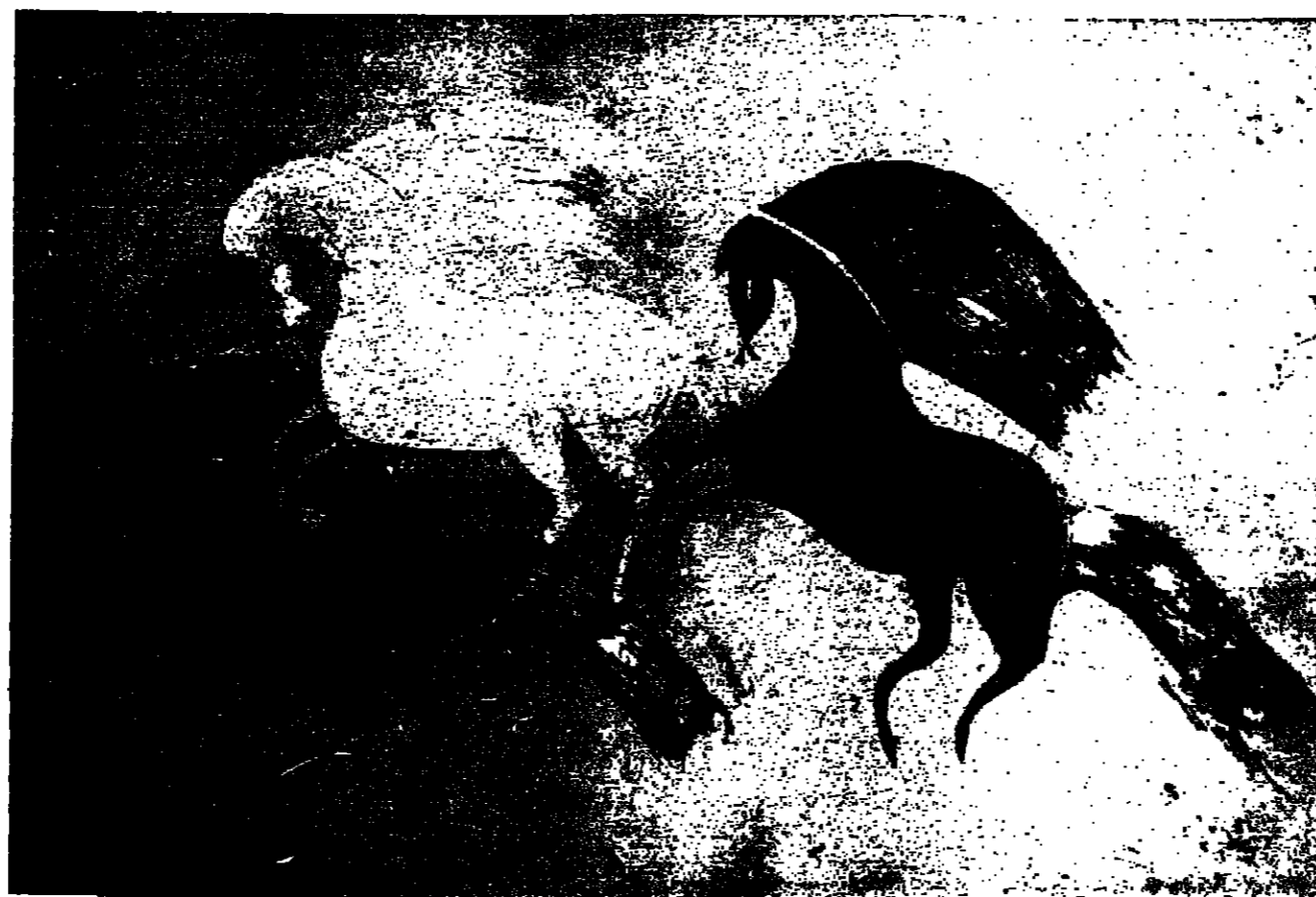
Wild horses bound across the expanse of imagination. (Batik print by Amman artist).